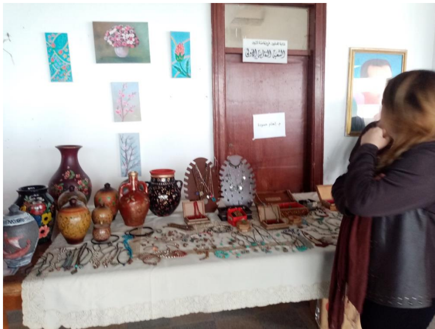
Fig 14: exhibition of the workshop 10