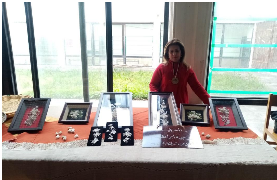
Fig 10: exhibition of the workshop 5