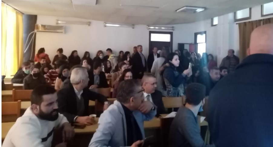
Fig 5 : audience

ERASMUS+ PROGRAMME Project Number: 610238-EPP-1-2019-1-JOEPPKA2-CBHE-JP