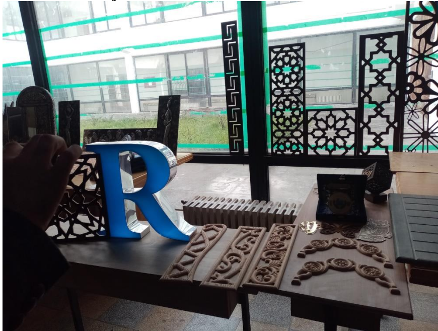
Fig 9: exhibition of the workshop 4

ERASMUS+ PROGRAMME Project Number: 610238-EPP-1-2019-1-JOEPPKA2-CBHE-JP