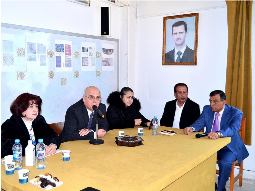
Fig3: opening of the event