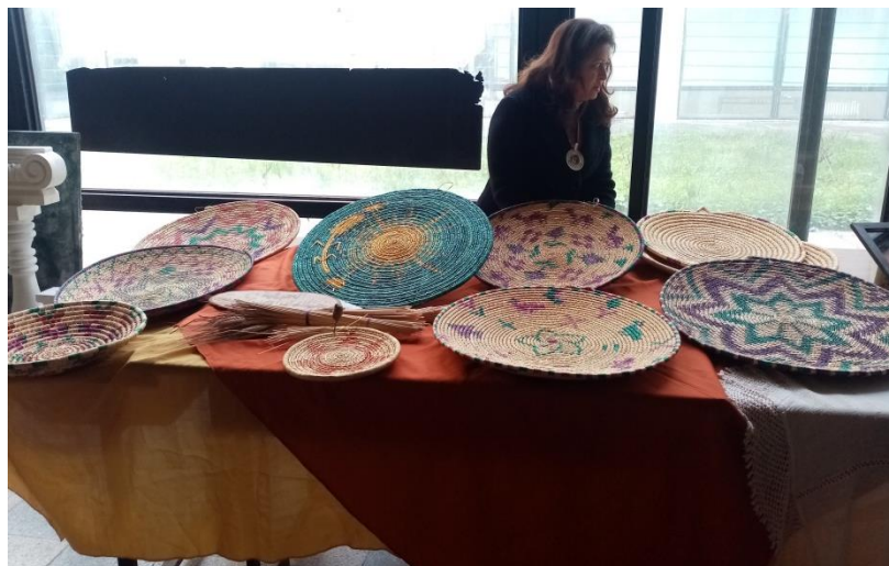
Fig 12: exhibition of the workshop 8