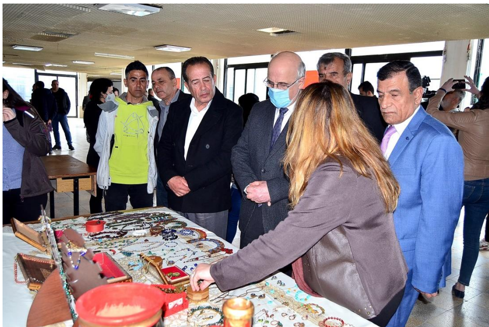
Fig 6: exhibition of the workshop 1