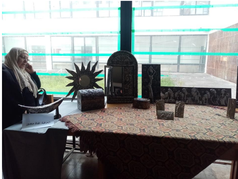
Fig 11: exhibition of the workshop 7

ERASMUS+ PROGRAMME Project Number: 610238-EPP-1-2019-1-JOEPPKA2-CBHE-JP