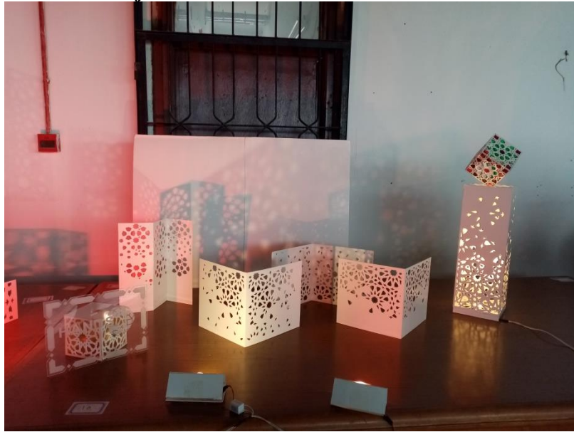
Fig 13: exhibition of the workshop 9

ERASMUS+ PROGRAMME Project Number: 610238-EPP-1-2019-1-JOEPPKA2-CBHE-JP